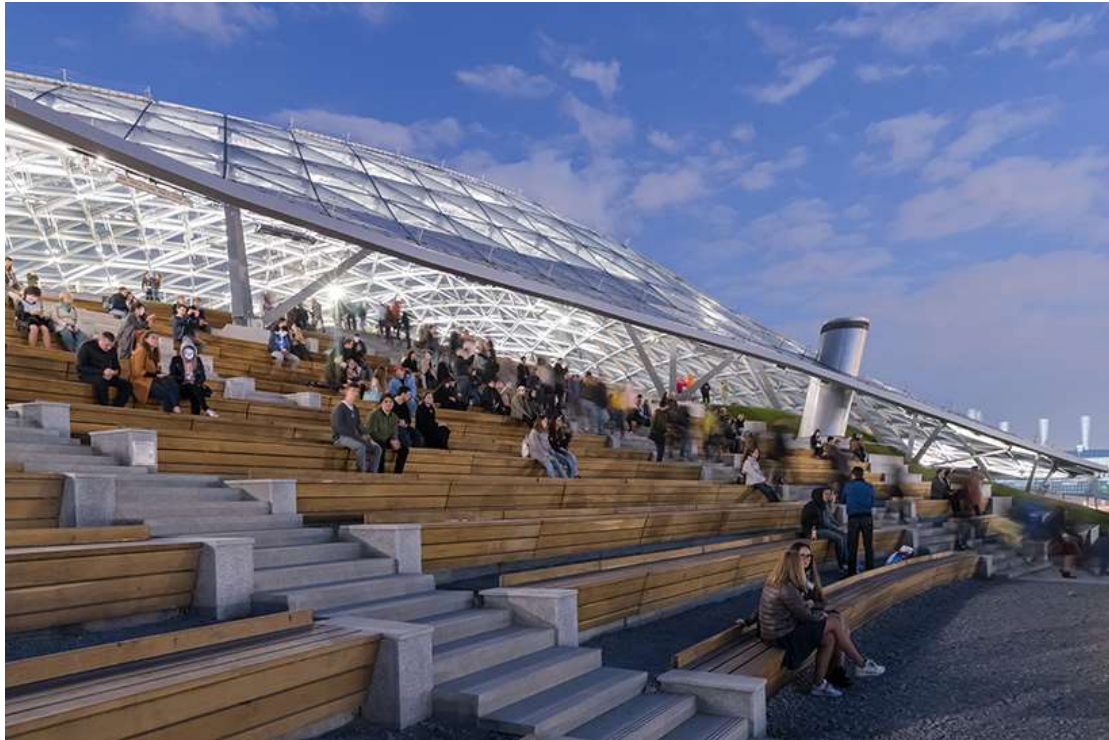
DS+R worked alongside hargreaves associates and citymakers to develop the project