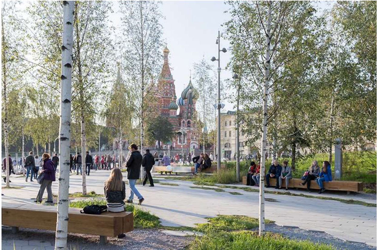
visitors find terraces that recreate russia's varied natural landscapes