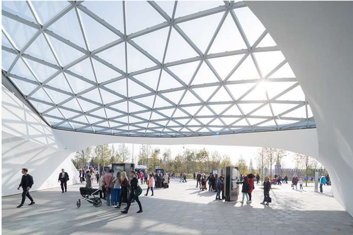
natural landscapes are overlaid on top of constructed environments