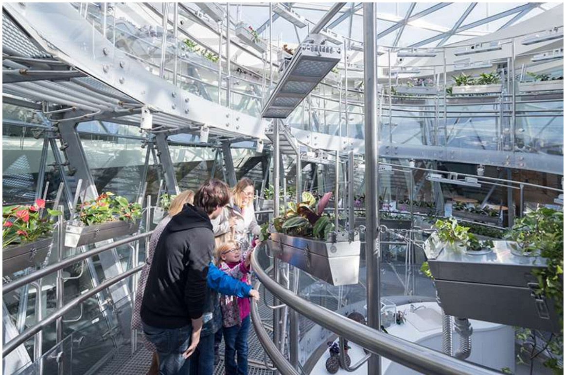
landscape and hardscape have been intertwined